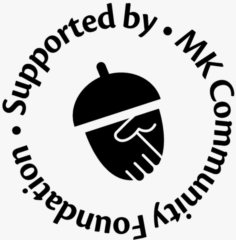
Option 1C - black single colour

The colour and white acknowledgement logos are our preferred options.