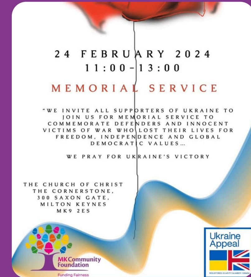
Ukraine Appeal Poster 2024