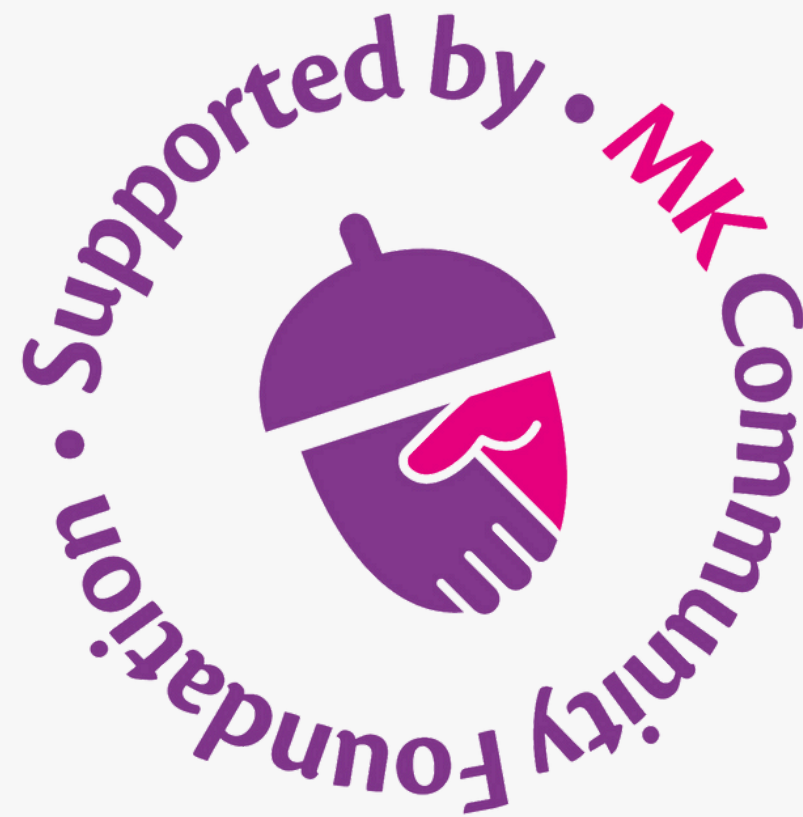
Option 1A - colour